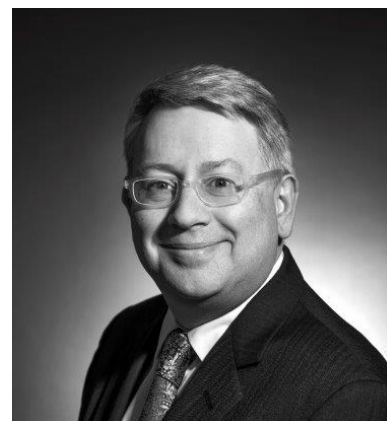
By Jeremy Furniss Partner, London

Regionally, preferences followed familiar patterns in Q2, with North America a popular home for Business Services deals (486 vs 461 in Q1), followed by Media & Technology (385 vs 316 in Q1) – a notable increase, and Industrial (315 vs 312 in Q1). Business Services (114 vs 126 in Q1) also led in the UK&I, followed, by Media & Technology (64 vs 76 in Q1) and Industrial (47 vs 56 in Q1). In Iberia, Business Services (47 vs 35) led Industrial (27 vs 15), followed by Consumer (44 vs 18), just as in the first quarter. The Nordics also led with Business Services (94 vs 72) followed by Industrial (77 vs 68), and Consumer (44 vs 28). Finally, in Asia-Pacific, sectoral interest stayed focused on Business Services, followed by Industrial and Media & Technology.